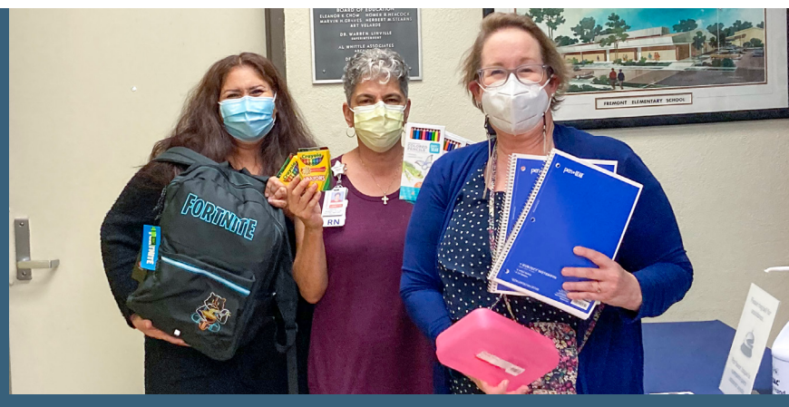
Beverly Hospital dropping off school supply donations to Fremont Elementar

Funds and in-kind services donated to community organizations or the community for a community benefit purpose.