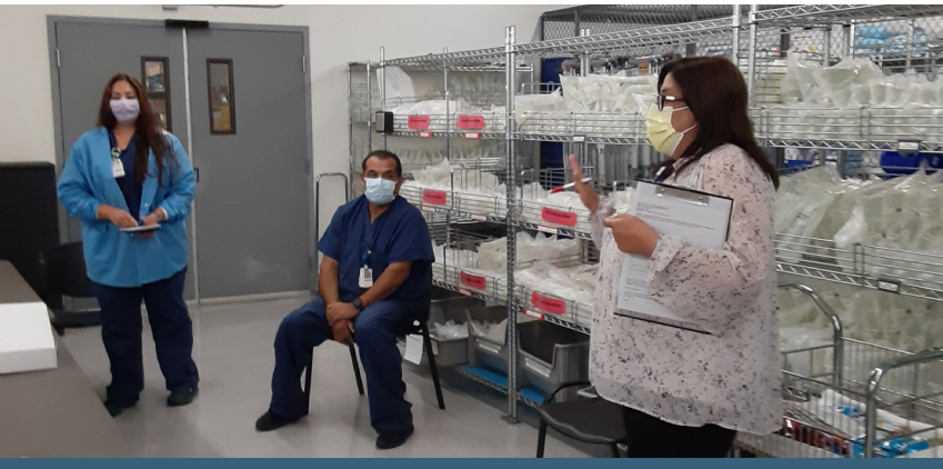
Disaster coordinator educating Beverly staff on active shooter preparedness

Education programs for physicians, nurses, nursing students, and other health professionals offered by the hospital throughout the fiscal year.